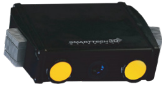
Small size of 3D scanner - 175x230x60 mm

SMARTTECH3D CobotScan is a 3D scanner designed and adapted for integration with cobots and measurement using a rotary stage module. The special design of the scanning head with a stereoscopic camera system ensures its lightness. Those features guarantee the highest degree of usage comfort, simplicity of hardware integration and high-quality mapping of complex geometry objects.